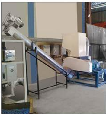
Screw Conveyors from Granulator to Washing