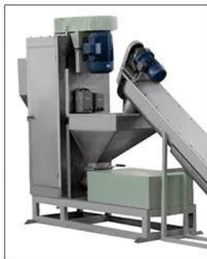
Water Dewatering system and Drying

Hikon Automatic Grinding washing and drying lines are developed to meet the challenges faced in plastic recycling industry. Hikon own designed lines are suitable for PE and PE films as well as article waste.